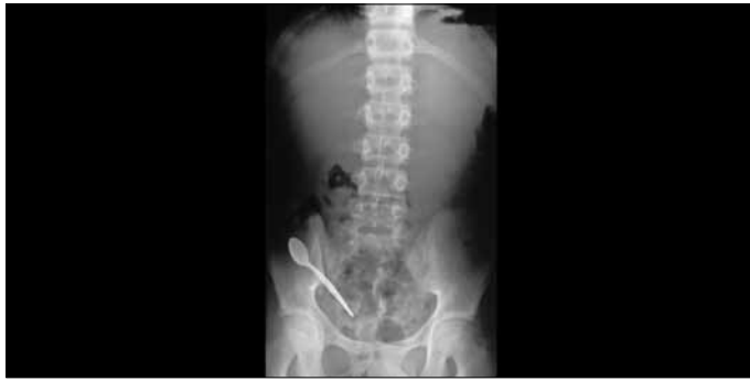
Figure 1. Standing direct abdominal radiograph shows a vertical teaspoon fixed in the right lower quadrant