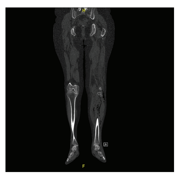
Figure 2. Lower extremity computed tomography. Air densities at the knee and cruris levels