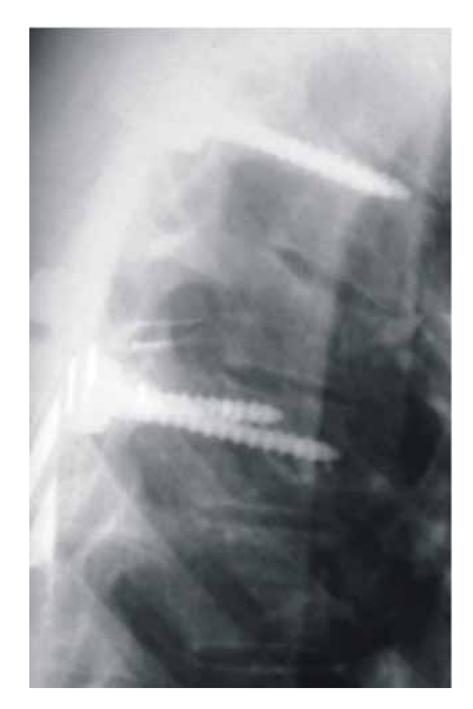
Figure 3: Lateral thoracic radiography: posterior transpedicular stabilization.